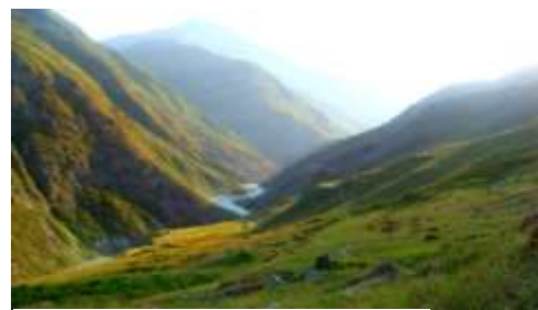
3. View on Yangob river