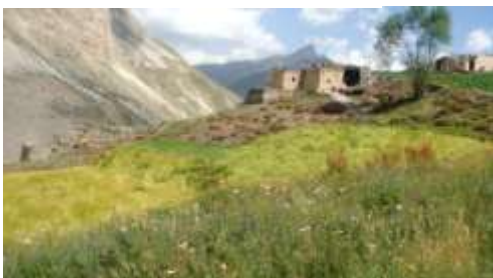
2. Pskon Village