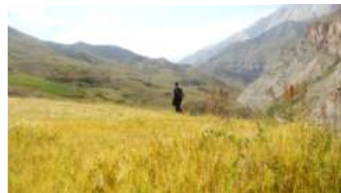
4. Fields on the altitude of 3000 m.