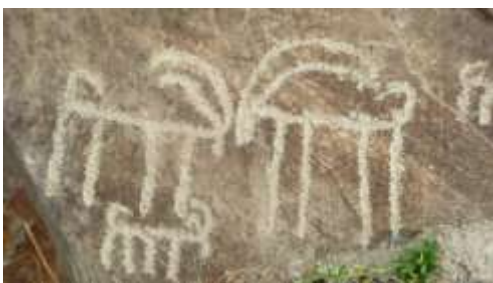
1. Petroglyphs close to Kirionte Village

If you would decide to visit the Yagnob area, we will be happy to organize the tour for you. You could ask for tour description and program, contacting us at : tic_panjakent@yahoo.com